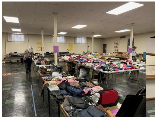
Indoor Yard Sale