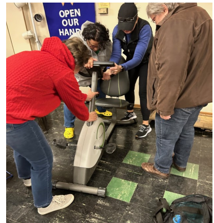
How many Methodists does it take?