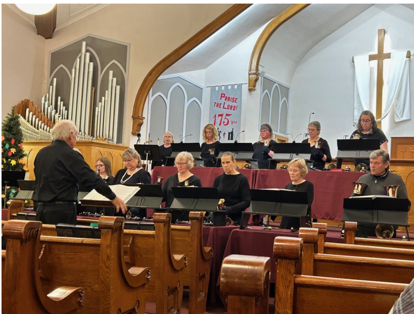
Community Bell Choir in Concert