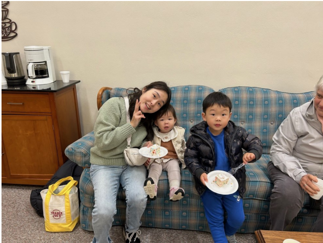
Enjoying the Cake