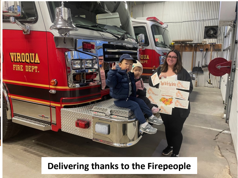
Delivering thanks to the Firepeople