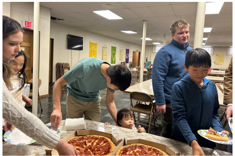
Youth Pizza Party