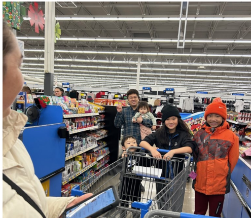
Christmas Family Shopping