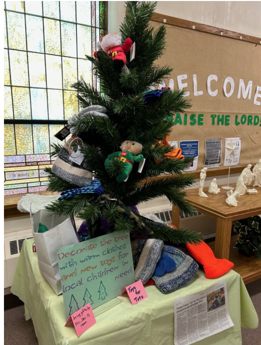
Toys For Tots Mitten Tree