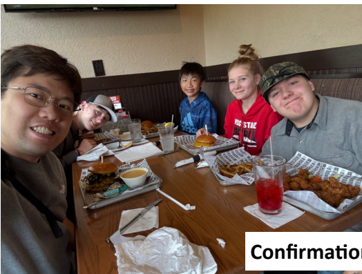
Confirmation Fun Night