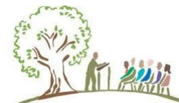
Outdoor Worship Service

Our annual Joint Outdoor Worship Service with Viroqua UMC is scheduled for Sunday, July 26 th at 10:00 AM. This year the service will be held at Davidson Park in Westby. Please bring your own lawn chair.